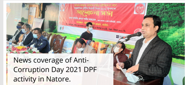
News coverage of Anti-Corruption Day 2021 DPF activity in Natore.