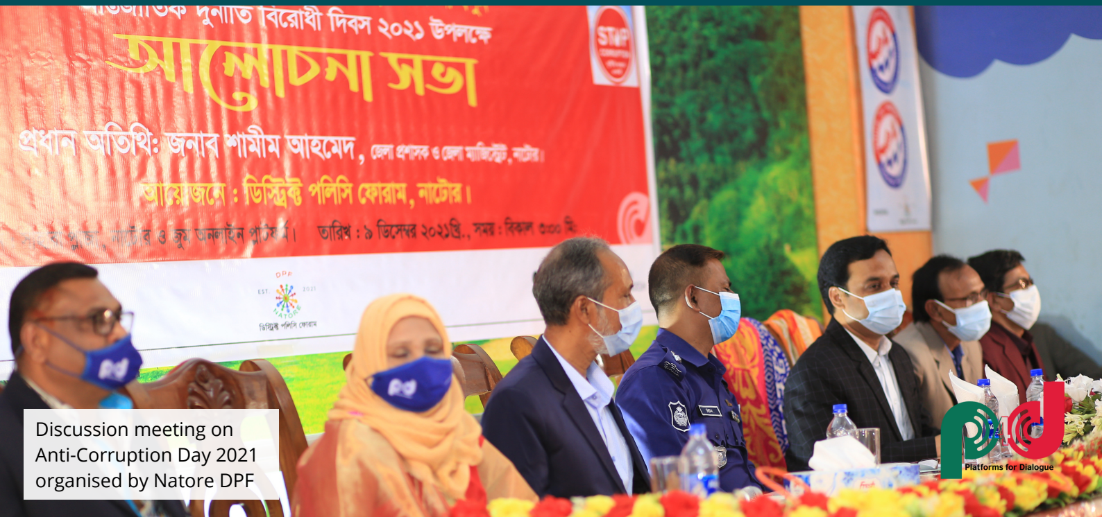
Discussion meeting on Anti-Corruption Day 2021 organised by Natore DPF

UN member countries around the world have observed the International Anti-Corruption Day on 9 December every year since 2005. Celebrating this day raises awareness of corruption as well as combats and prevents it in order to promote resilience and integrity at all levels of society. The 2021 International Anti-Corruption Day highlighted individual rights and responsibilities with the theme “Your right, your role: Say no to Corruption”. The United Nations took their first step to fight corruption in December 2003 when they passed the United Nations Convention Against Corruption (UNCAC). This later came into effect on 14 December 2005. Celebrating Anti-Corruption Day in Bangladesh bares special significance at this point in time, as the government has taken measures to curb corruption in public and private spheres with the introduction of social accountability tools.